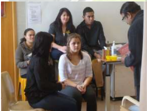
Actors in role