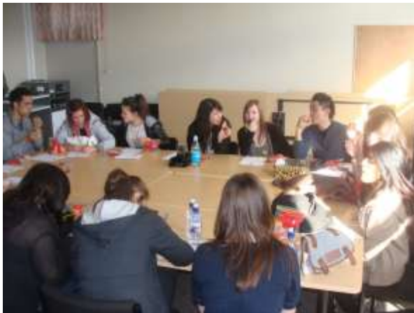
Students enjoying the food between performances