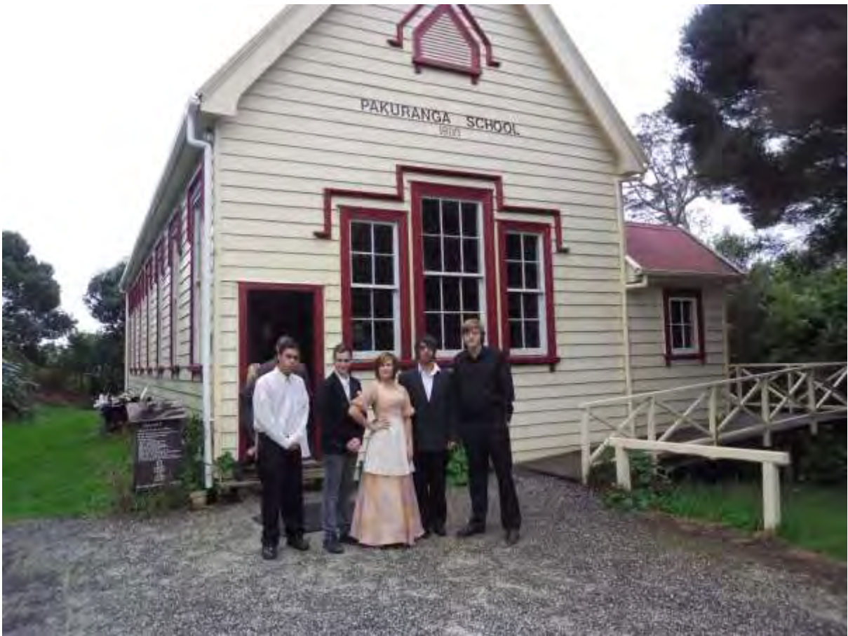
Year 13 outside the Old School at Howick Historical Village