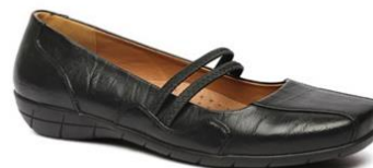
Sabrina available from Number One Shoes