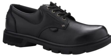
Rugged Shark, available from Hannahs