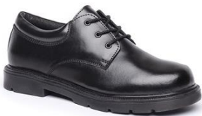
Layton School Shoes available from Number One Shoes