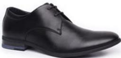
Michael Dress Shoes available from Number One Shoes