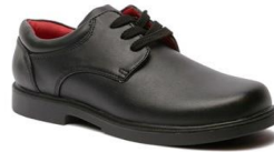
Eva School Shoes available from Number One Shoes