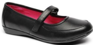
Ladi School Shoes available from Number One Shoes