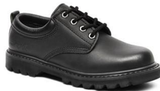
Detention school shoes available from Number One Shoes