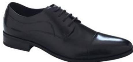
Cyrus available from Hannahs