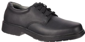
Daytona, available from Hannahs